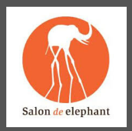
SALON DE ELEPHANT